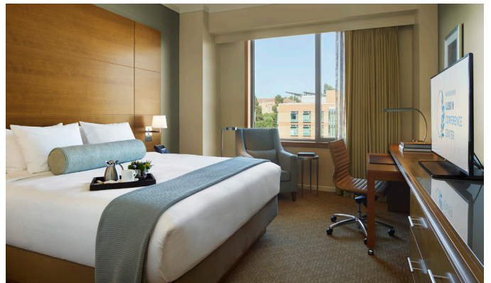
Guest Room with complimentary Wi-Fi and built-in workspace