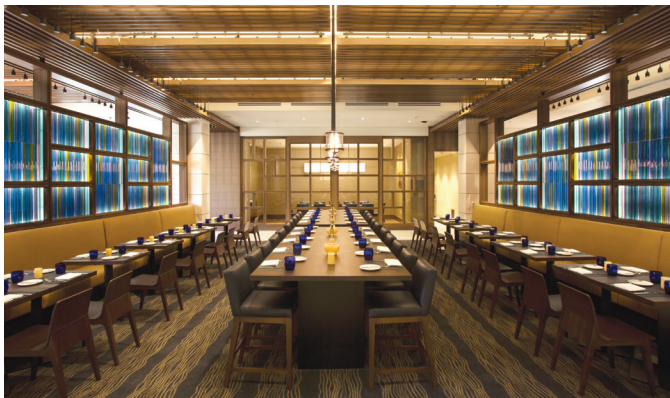
Platea—on-site Mediterranean-inspired restaurant and lounge

The UCLA Meyer and Renee Luskin Conference Center is designed to serve the needs of individuals and groups attending campus meetings or events; those doing business with UCLA entities; and University of California faculty, students, staff and other University affiliates. All conferences, programs and events held at the Luskin Conference Center must have an eligible learning or educational purpose. All requests to reserve meeting space at the Luskin Conference Center will be reviewed for approval to ensure the activity is in alignment with the university’s mission of teaching, research and service.